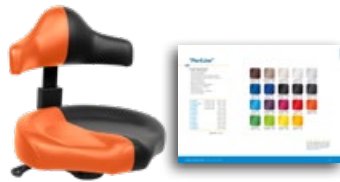
"PeriLine" Page 105