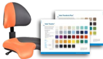
"skai Tundra" Page 102