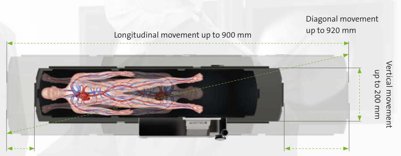
Longitudinal movement in head-sided direction up to 250 mm

Real Free-Floating: Free-Floating in each direction.