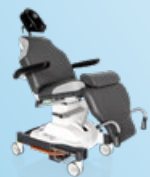
500 XLE comfort