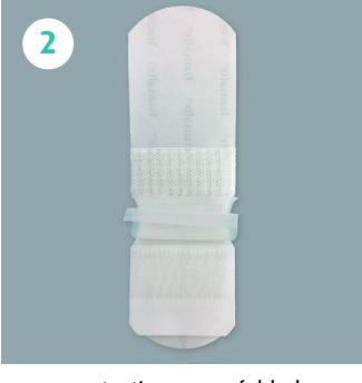
protective paper folded