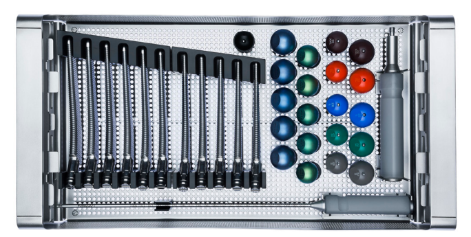
Rasp Instrument Set Müller Straight Stem