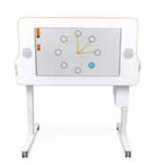
4. Fully tilted eg. hospital bed