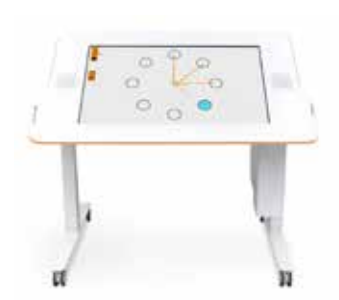
2. Extended for eg. wheelchair