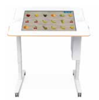
3. Extended and tilted eg. standing