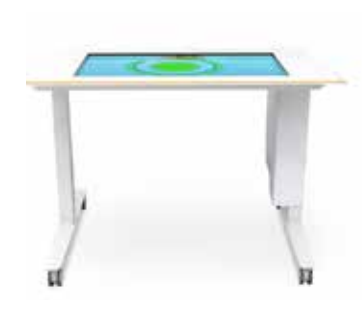
1. Starting Position