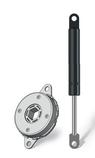
Rotary damper and Hydraulic damper

for adjusting the footrests and for the stand-up aid